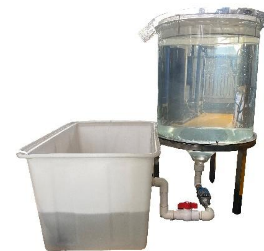
Figure 3. Upflow Circulating Water Scallop Hatchery System Prototype